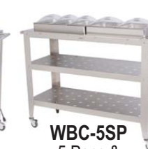
WBC-5SP 5 Pans & 5 Individual Lids

WBC-4RT, WBC-4SP, WBC-5RT WBC-5SP: 400 Watts / 3.4 amps / 120 Volts / 60 Hz 2 Temperature Controls (one per side: total active heat area: 43" x 15")